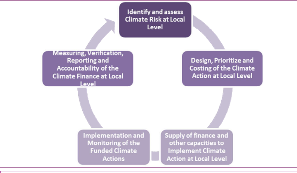
Figure 2 Proposed Local Climate Fiscal Framework

link climate change priorities with expenditure and taxation-budget transfer decisions through the budget process. This framework will ensure that external finances (national and international climate finance) are used most effectively alongside own (LGIs own income) resources and that private investments (NGOs, CBOs and Private Companies) are encouraged.