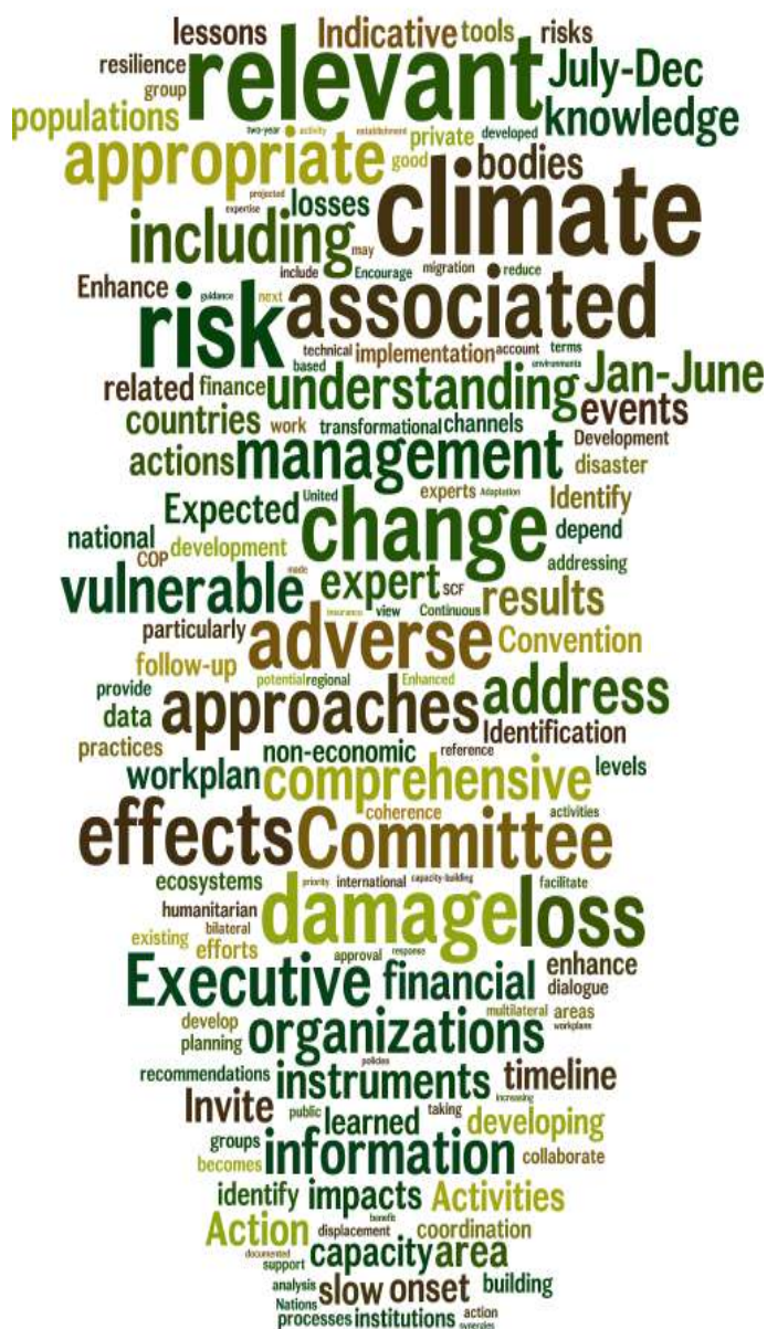
Figure 2. Loss and damage within the UNFCCC. Word cloud created by Masroora Haque