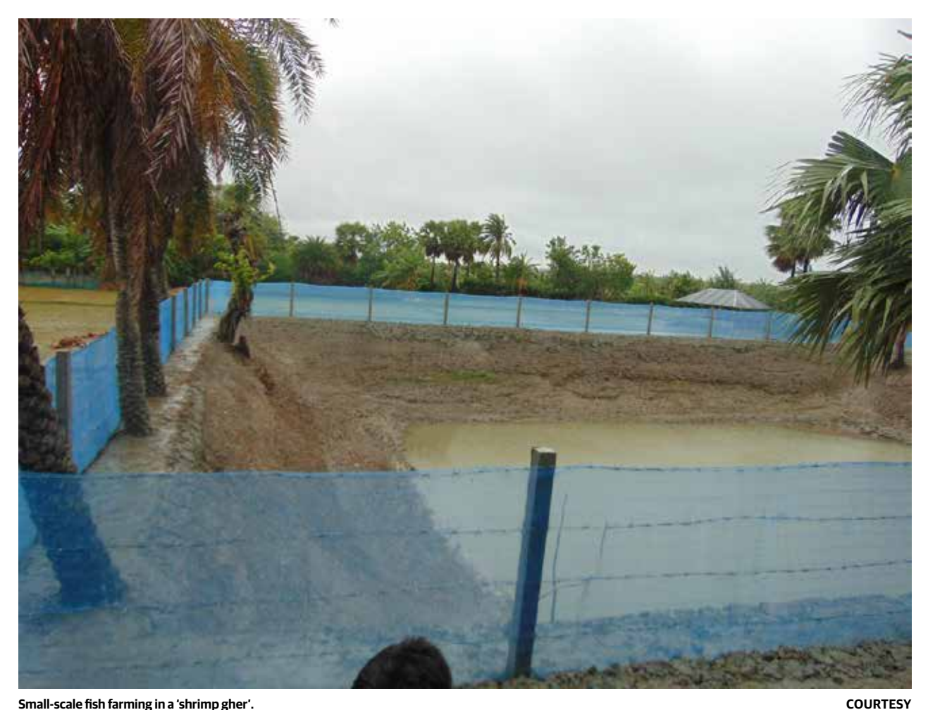
Small-scale fish farming in a 'shrimp gher'.