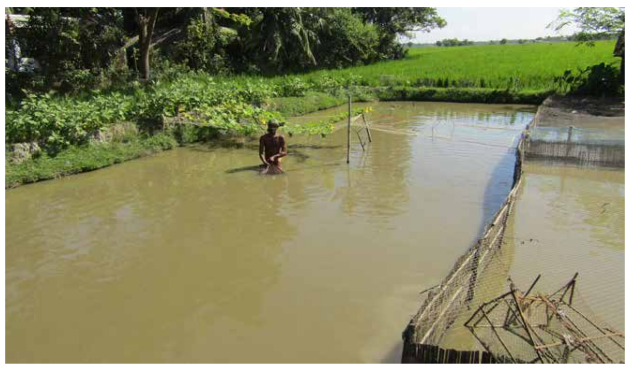
Fisherman fishing in local fishponds, where salinity is a key reason for low production.