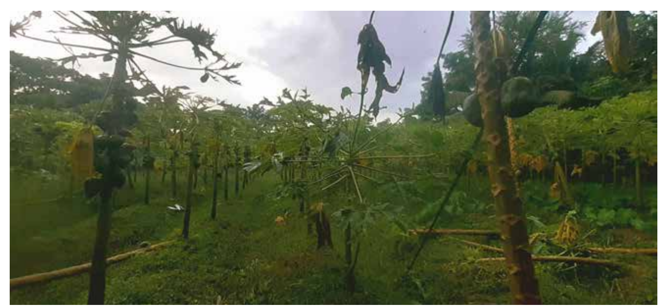
Damaged vegetable (Papaya) yard due to heavy rainfall and waterlogging.

The world's climate is changing day by day and becoming a more severe threat to agricultural sectors. Due to its vulnerable geographical position and other environmental reasons, Bangladesh is one of the most climate-vulnerable countries in the world. Based on the present climatic scenario, the climate of Bangladesh can be grouped by medium to heavy rainfall in the rainy season, high temperature in the summer season, and high humidity in the winter season, whereas once it used to have six different seasons with their different flavors. Effects of climate change have become a great threat to agricultural sectors in both scholars' and farmers' perceptions.