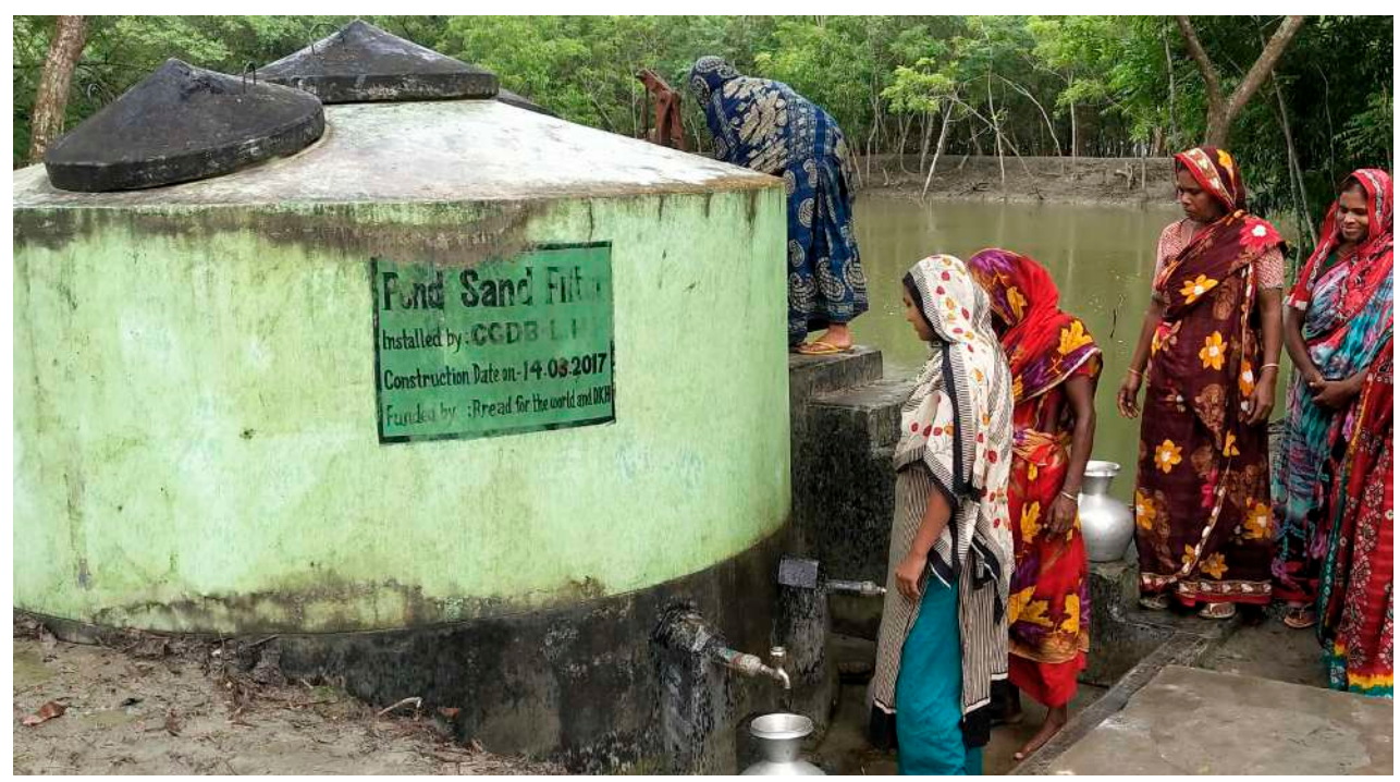
Women are collecting potable Water from their own managed Pond Sand Filtration (PSF) Plant