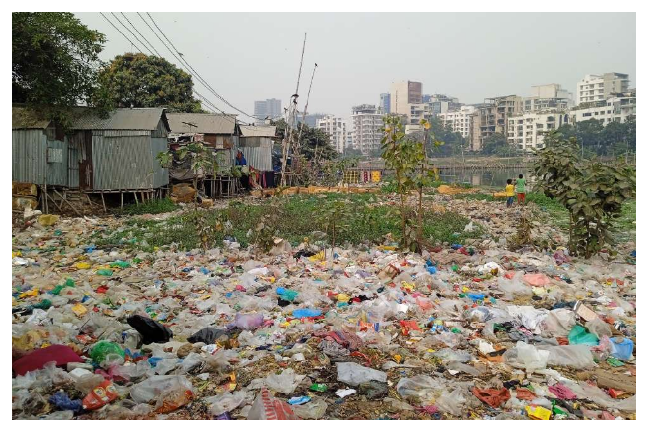
The slums are built against the shoulders of high-rise buildings and are home to most of low-income people, but even in these conditions, they have to pay a high price to get essential services