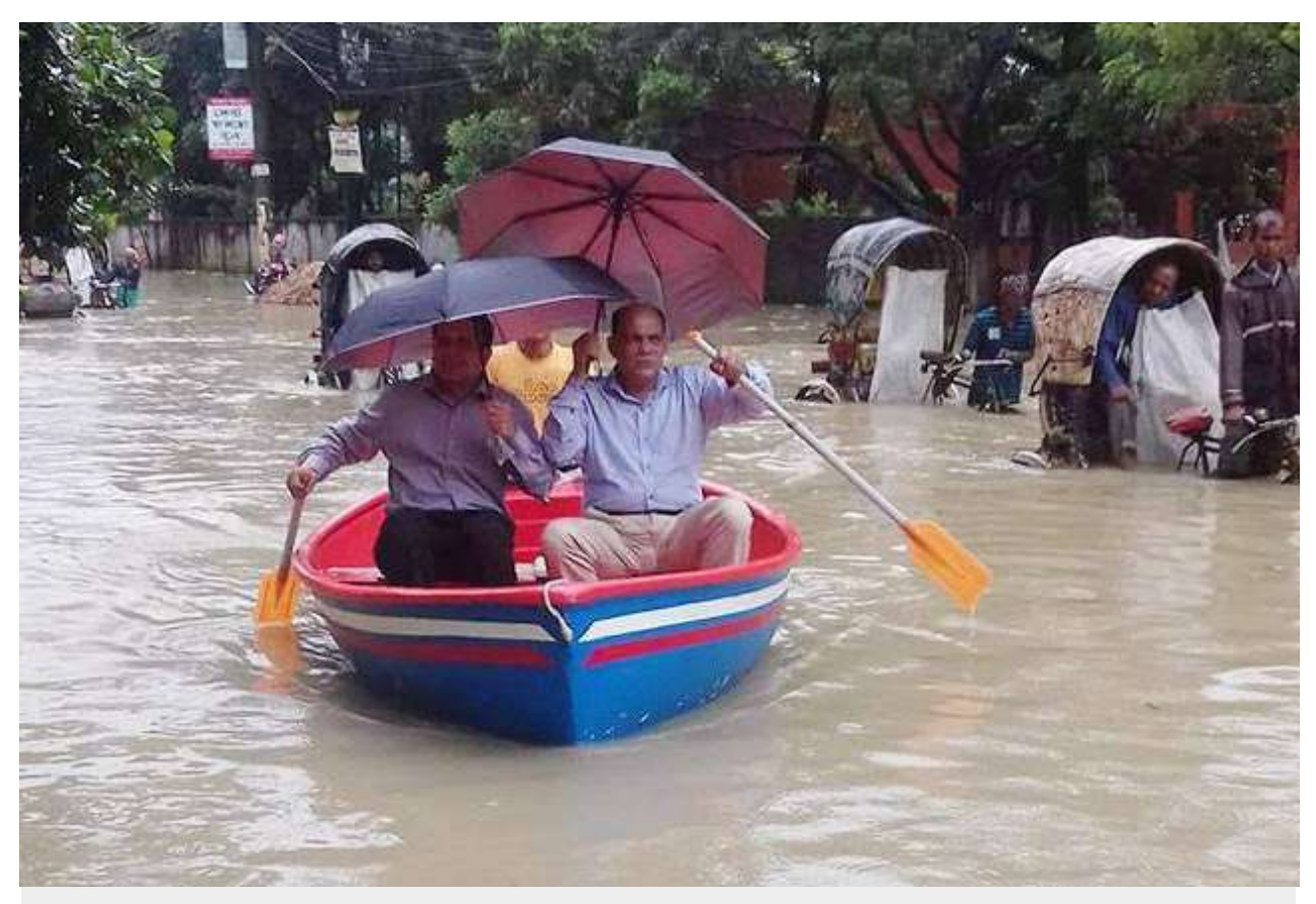
Commute by boat during office time during monsoon season at urban area.