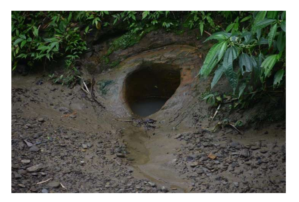
Figure 3: Water Pit to Collect Stream Water

From extensive literature review and FGDs, it was recorded that the local people mainly conserve the VCFs for watershed management. They believe, if they conserve the VCFs they could get water continuously from the waterfalls. However, in the last few years there has been less water flow through the streams due to the erratic and decrease in the rainfall pattern. Besides, they have also blamed the rapid deforestation and stone extraction to be the other major reasons for this phenomenon. Consequently, many local communities had to migrate to other places in quest of water to ensure their livelihood and survival. Another issue that came to light during the survey, was the issue of menstrual health and hygiene management of women in that area. It was reported that, drying up streams bear negative consequences for reproductive health of women. Besides, the women need to walk for miles to fetch fresh water which impacts their physical health, reduces their leisure time, and increases the intensity of unpaid care work.