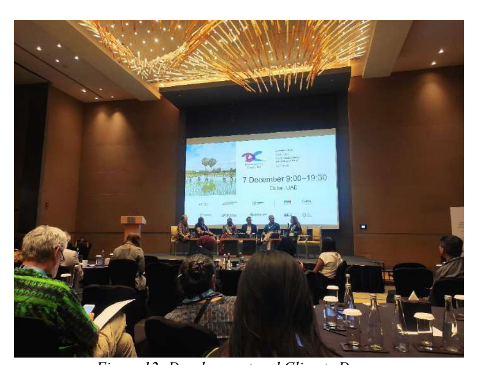
Figure 12: Development and Climate Days