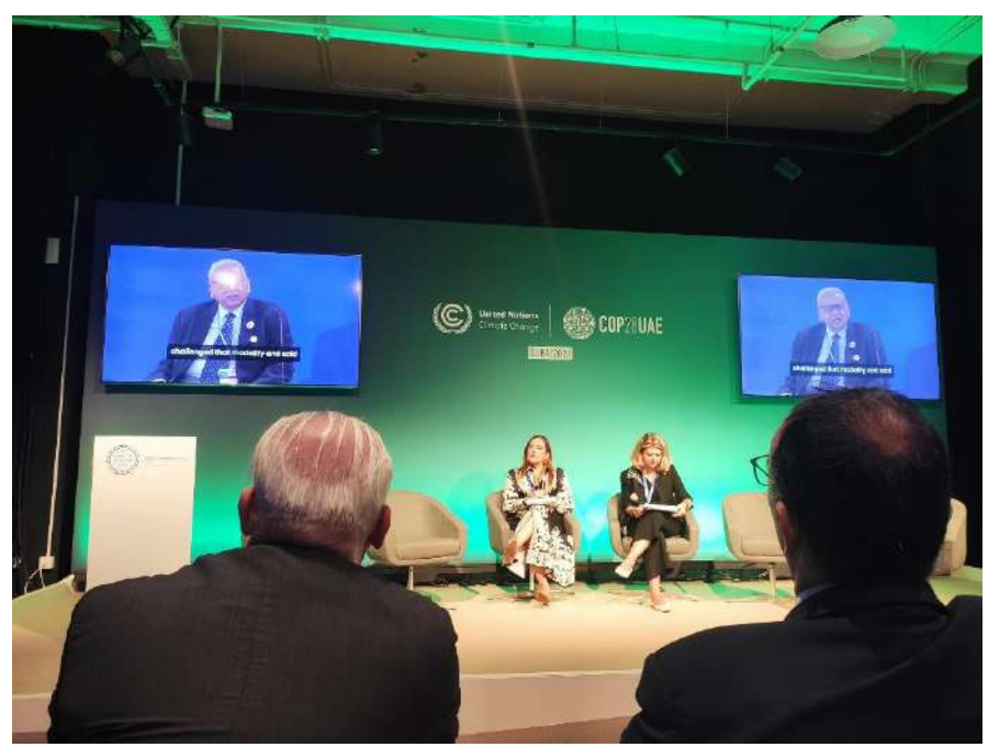
Figure 9: Remembering late Professor Saleemul Huq at the 5<sup>th</sup> Opening Ceremony of Capacity Building Hub