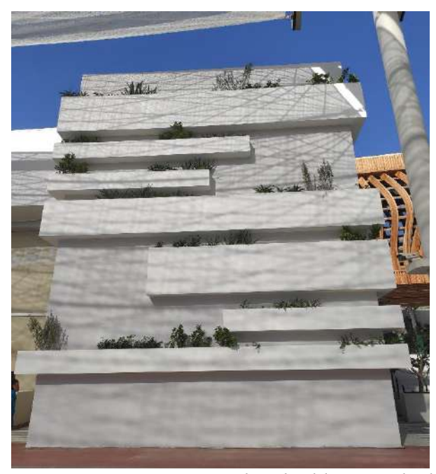
Figure 3: Using spaces in a white building inside the Expo city