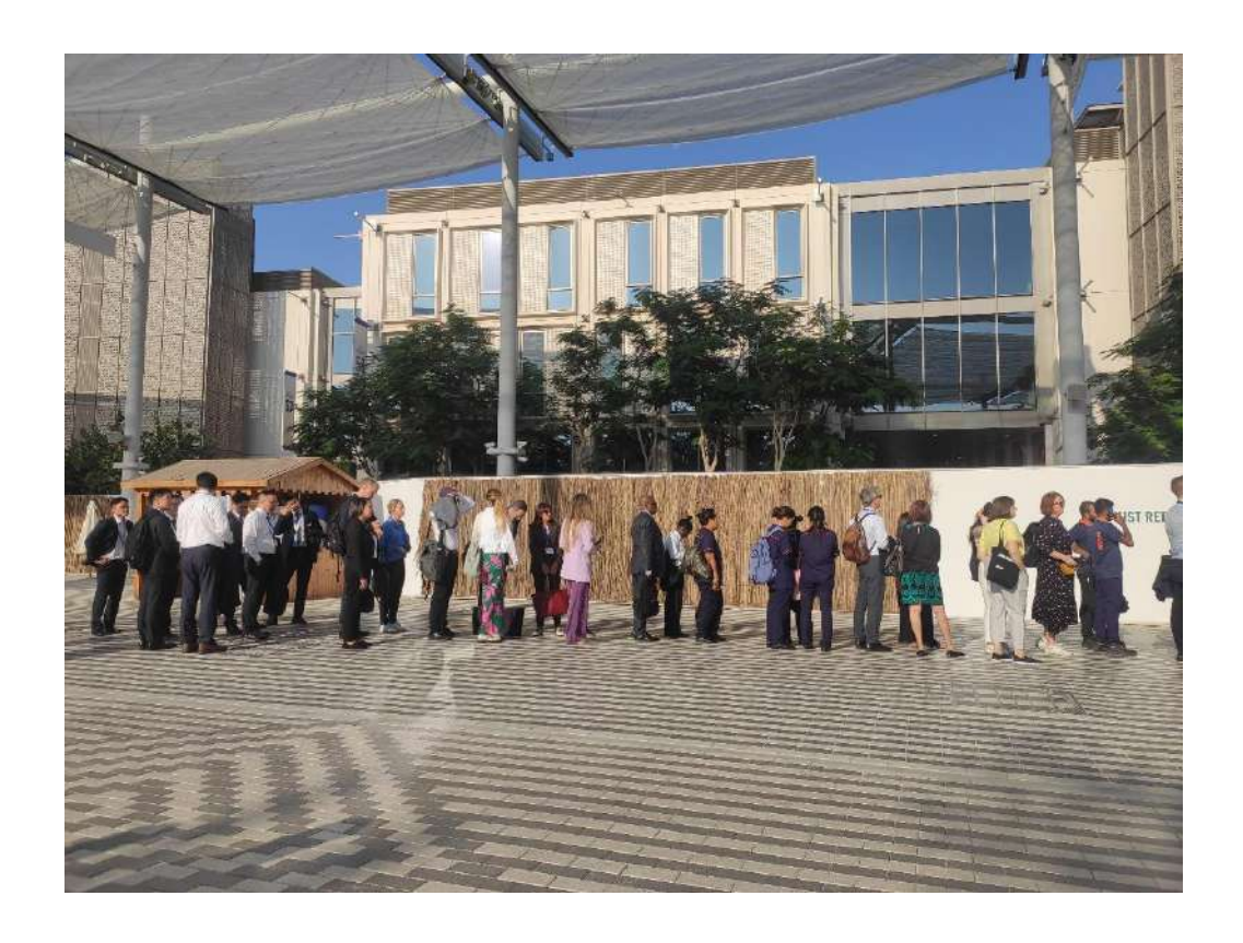
Figure 7: A long line in Infront of the security checking booth of the Green zone