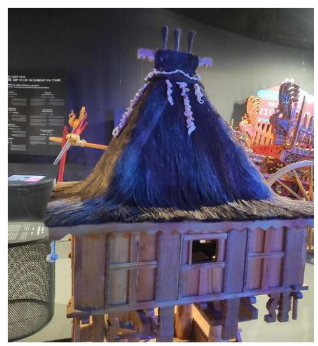
Figure 4: Traditional Totem House of Timor-Leste