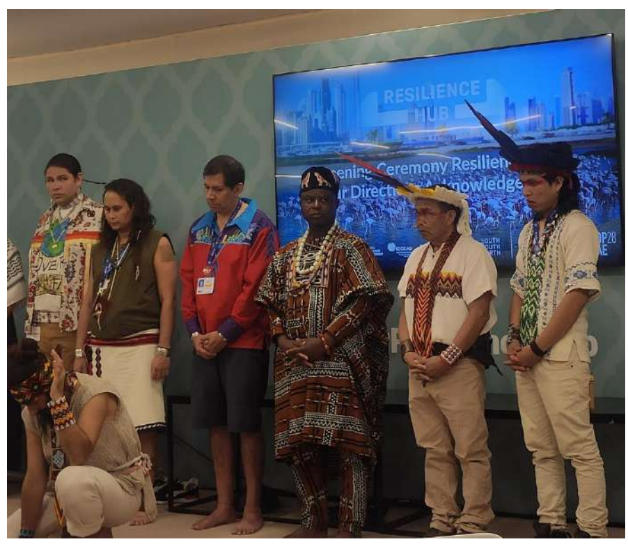
Figure 6: Opening Ceremony of Resilience Hub

opening ceremony started with their traditional prayer and shared their ideologies of why they are closed to nature and why it is necessary to stop degrading nature.