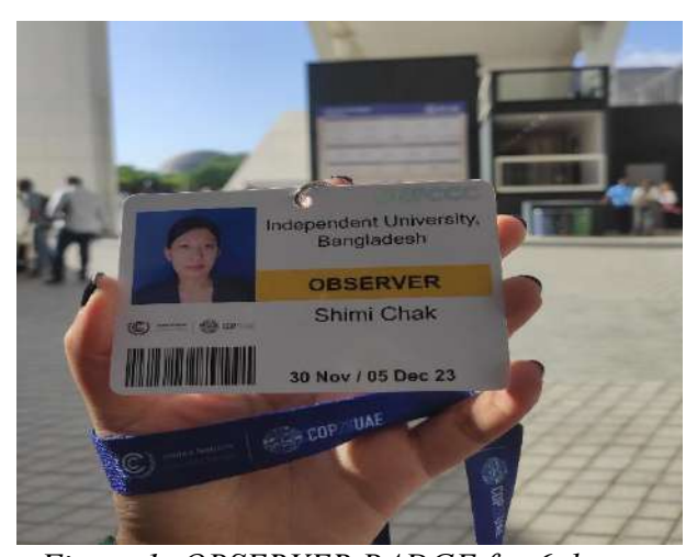
Figure 1: OBSERVER BADGE for 6 days

Registration at COP: After getting into the Expo City, I went through the registration Booth, and there was a huge line. I gave them my passport and UN acknowledgment letter at the registration booth. Then they took a picture of me on the spot, it was a machine on the spot. Then they issued my COP Badge. I got the Yellow Badge "OBSERVER" Badge. Then I went to the security check and got to the main venue. After passing the security check, we went to the "Service Centre" to collect the free metro pass and water bottle. The metro pass was free to all public transportation till the COP ended. As it was our first day, we were trying to find and understand the map. Since we had to catch an event around 10 AM. We were lost and struggling to find the exact location of the event, as it was the very first day of COP, and some of the buildings did not have the number plate that day. Hence, we took a lot of time to explore the unnumbered building was our destination. But while we were looking for the destination, we also explored other pavilions and read the nameplate and organization events to memorize.