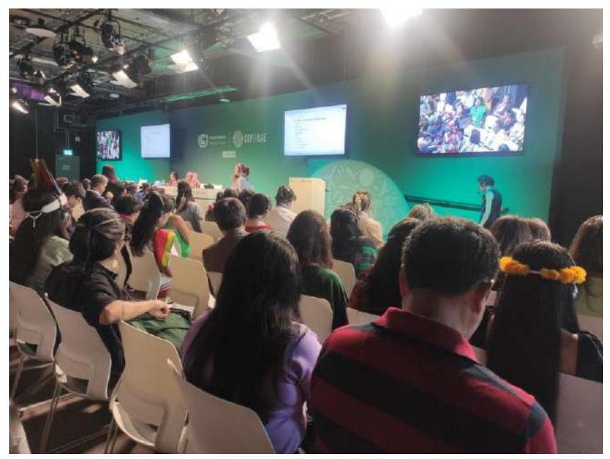
Figure 11: At an event of the Indigenous Pavilion